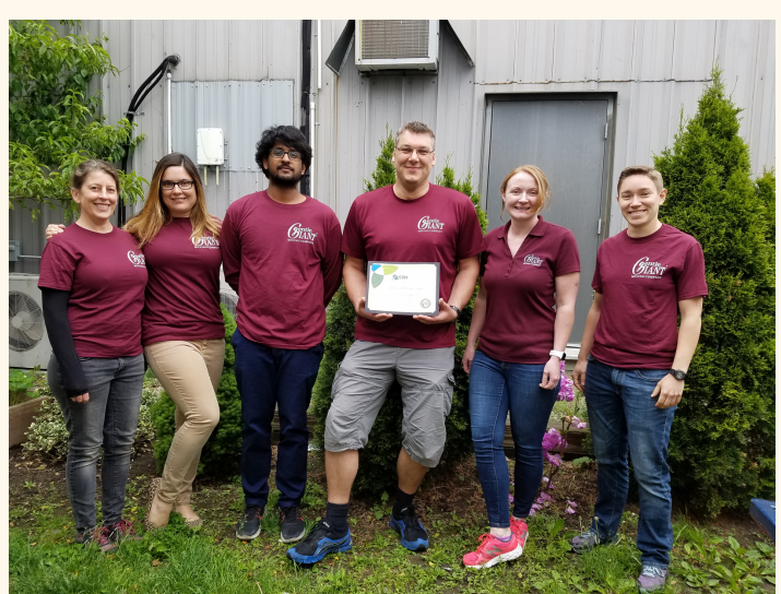
Gentle Giant Employees holding their SBLP Certificate in 2019