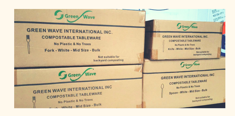
Compostable Tableware that Gentle Giant Uses at the Office